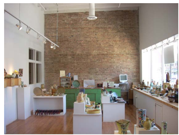
NEW SPACE AT WEST END