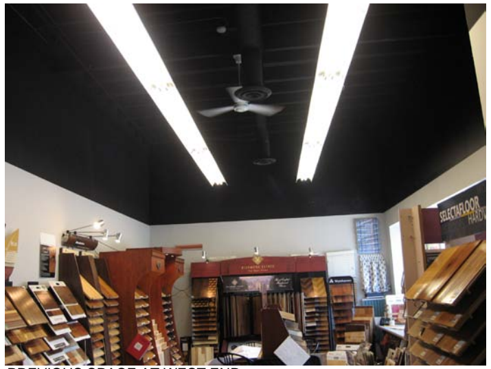
PREVIOUS SPACE AT WEST END