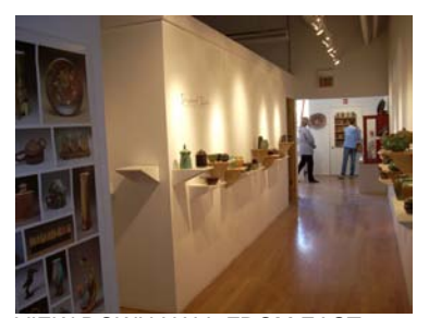
VIEW DOWN HALL FROM EAST