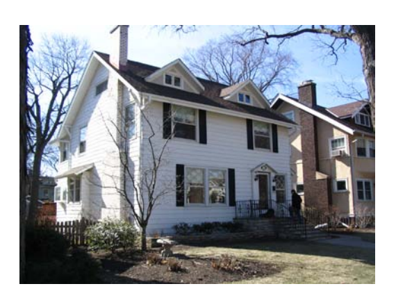
FRONT OF HOUSE: PREVIOUS