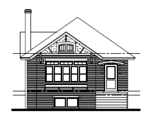
FRONT ELEVATION - EXISTING

A new second floor is added to an existing brick bungalow style, which makes use of the existing stucco and halftimbering style of the front and side gables. New open stairs, with ample light and ventilation provided, lead to the second floor spaces that include a Master Bath and second Bath. The new Master Bedroom, two Bedrooms and Dressing Room upstairs are provide with generous vaulted ceilings. Extensive renovation of the first floor includes a remodeled bathroom, a kitchen with a more suitable and efficient layout, and new vaulted ceilings at the living room.