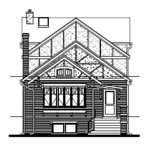
FRONT ELEVATION - NEW