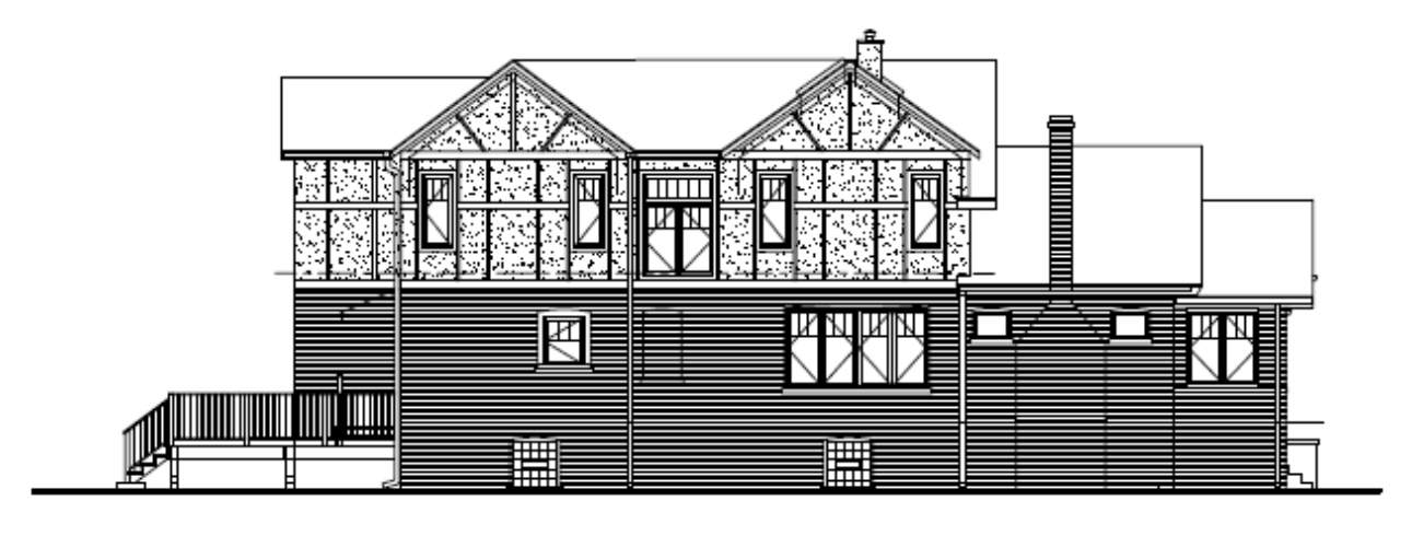
SIDE ELEVATION - NEW