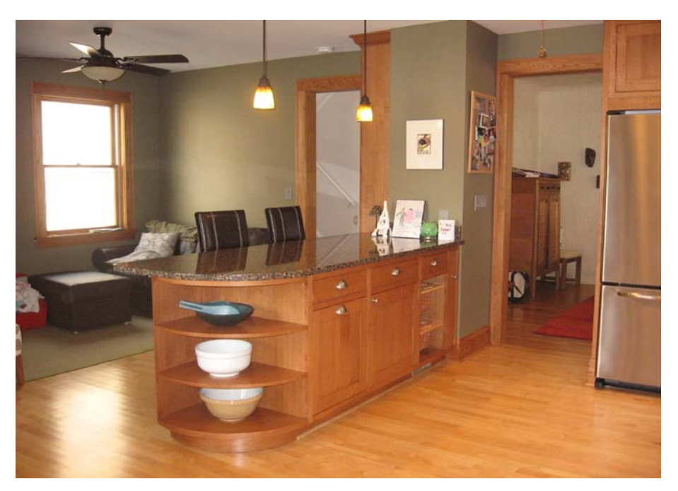
VIEW TOWARD NORTHEAST

1008 S. Home Avenue, Oak Park, Illinois 60304 708-358-1020 fax 0155 email: info@archandcons.com www.archandcons.com