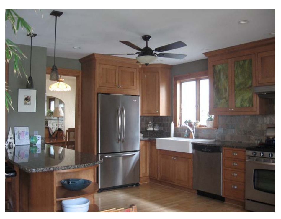
VIEW TO SOUTHEAST