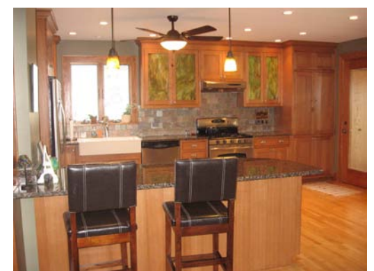
VIEW TOWARD SOUTH

Two bearing walls were removed and concealed beams were installed above the ceiling to support the Second Floor and roof above. A new Entry / Mudroom with closet and bench opens to the rear deck and yard.