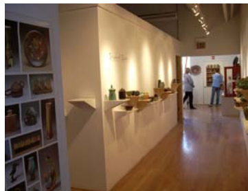
VIEW DOWN HALL FROM EAST