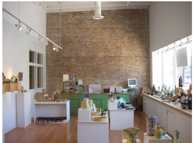
NEW SPACE AT WEST END