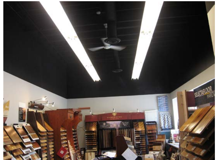
PREVIOUS SPACE AT WEST END

Converting the south portion of a retail showroom and warehouse created a ceramic art gallery space at the street side, with additional display areas extending along the hallway toward new rooms for ceramic and metals classes. Existing roof structure was used to configure partitions and spaces. New ductwork and lighting was installed throughout, along with new electrical service for clay firing kilns at the rear of the unit.